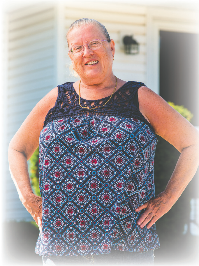
Carol Madison Weatherization Program

Weatherization: weatherizes homes in the city of Erie including furnace repair and replacement