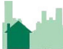
Erie Weed and Seed