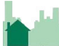
Erie Weed and Seed